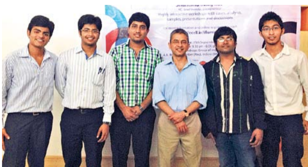
Chief speaker along with coordinators of the workshop

Bhagwat said, "We firmly believe there is no other way