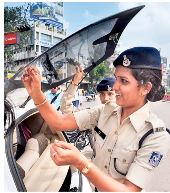
Women constable removing black film at Regal Square on Tuesday

However, the Supreme Court has permitted use of black films in the official cars of the VIPs and VVIPs (ostensibly for security purposes). The appropriate government is free to make any regulations in this regard. Therefore, the ban on the black films on car windows will apply to commoners.